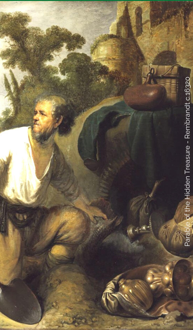
Parable of the Hidden Treasure - Rembrandt c.16320

30 JULY 2023 SEVENTEENTH SUNDAY IN ORDINARY TIME (A)